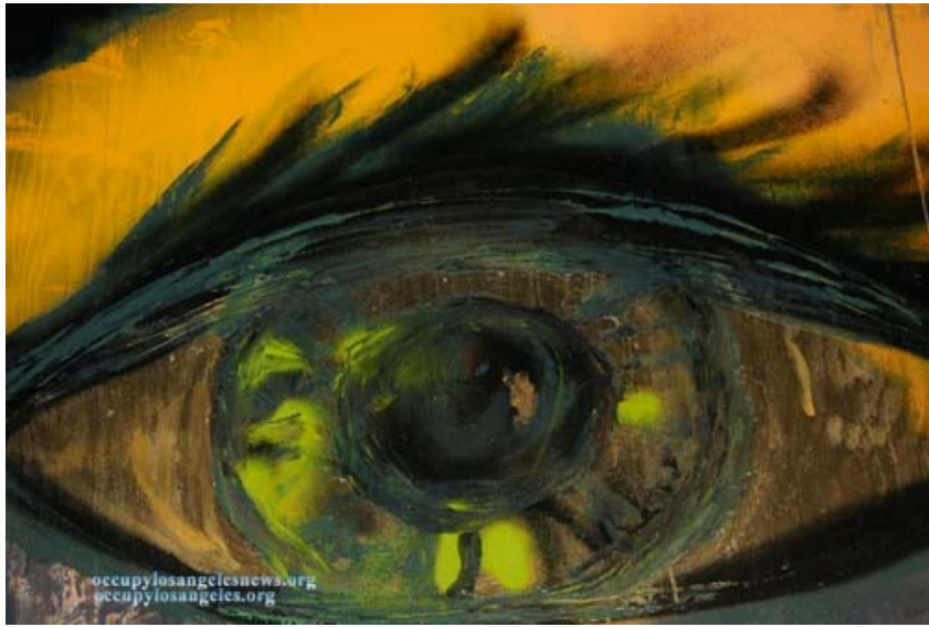
Occupy Los Angeles News