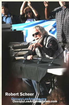
Robert Scheer